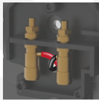
2. TERMINATE WIRES