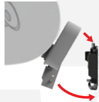
3. ATTACH THE SPEAKER TO THE WALL PLATE