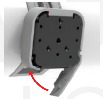
4. CLOSE THE LOCKING LEVER