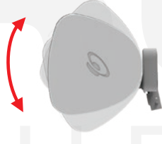
3. ADJUST THE SPEAKER ANGLE